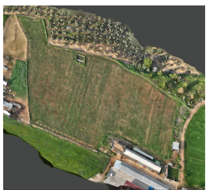
Figure 11: Orthomosaic of the plot of the IES Virgen de la Cabeza in Marmolejo (Jaén), Spain.