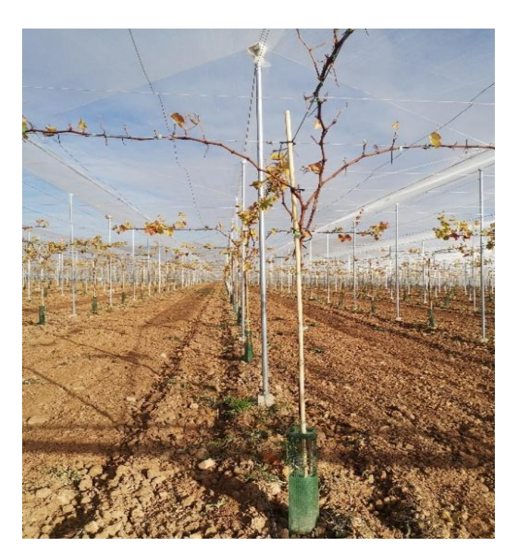
Figure 19: Viticulture (A.Seco de Herrera).

In multifunctional agriculture, we will orient our production not only from an agrarian point of view, but also in global terms, correlated with the externalities of the geographical area and its characteristics in which the multifunctional agricultural use is located.