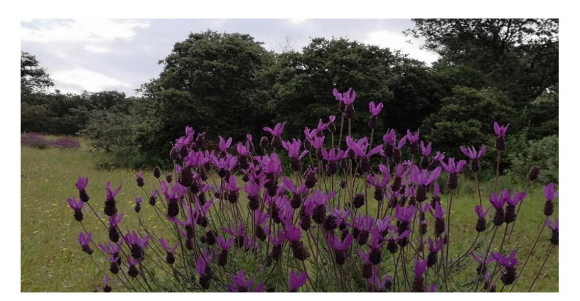
Figure 18: Exploitation of natural resources (A.Seco de Herrera).

In multifunctional agriculture, we will orient our production not only from an agrarian point of view, but also in global terms, correlated with the externalities of the geographical area and its characteristics in which the multifunctional agricultural use is located.