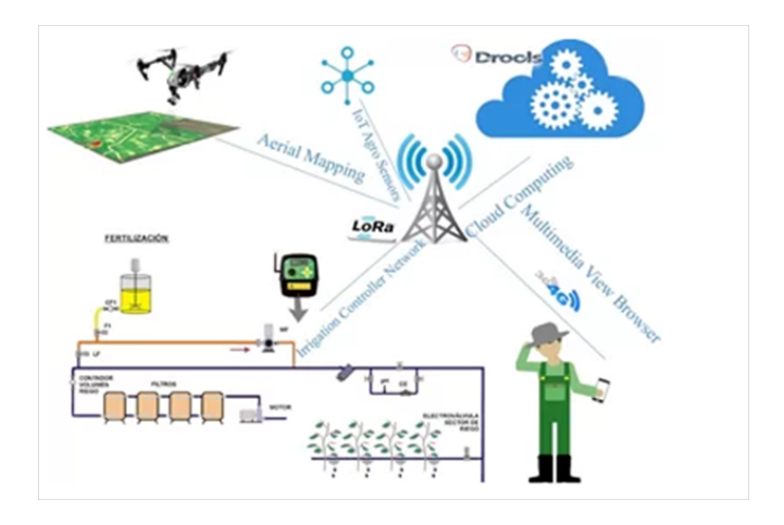
Figure 12: Integration of <u>LPWAN</u> Technology for Smart Agricultural Monitoring and Management.

LoRaWAN is a networking specification designed for low-power IoT devices that communicate over long distances. This technology operates in licence-free frequency bands, allowing it to be used worldwide without the need for special permissions.