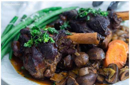
Figure 2: Local products and recipes are often preferred by food tourists.

The concept evolved from the pursuit of unique and memorable food and drink experiences (in the 2010s). It became a mainstream interest with the help of social media and TV shows, and eventually turned into a primary motive for many travellers when choosing a destination. Thus, travellers began to spend more time and money on unique food and beverage experiences, making the exploration of local cuisine the focal point of a cultural adventure.