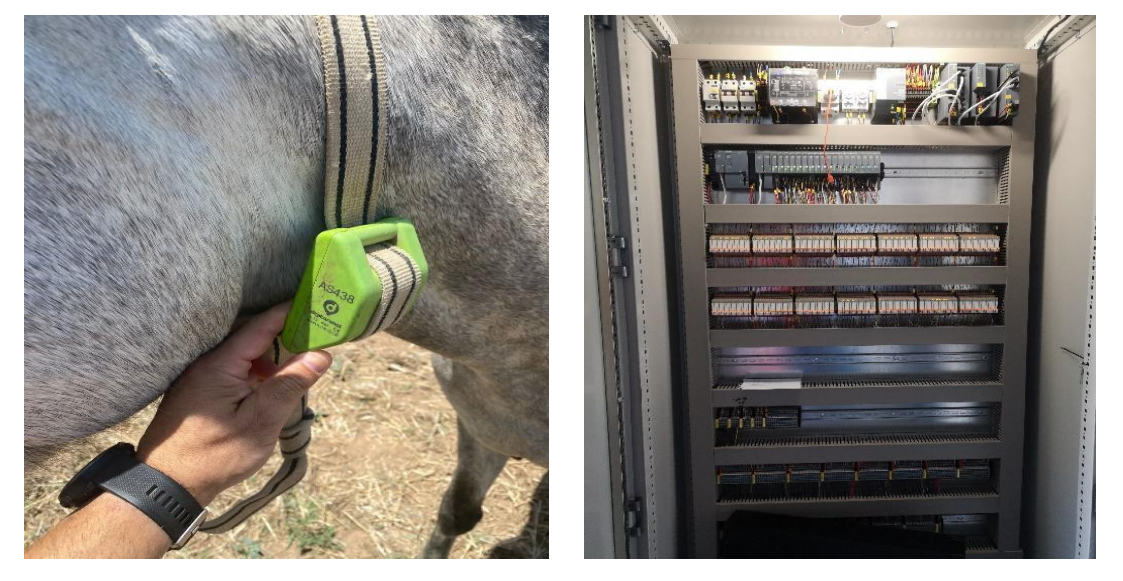
Figure 25: Detail of technical resources, GPS positioner and computerised control panel.

Technical or technological resources are the technological means of a tangible or intangible type. The tangible resources are computers, smartphones, security systems etc. Intangible resources include computer programmes, operating and security systems, etc. It should be noted that in some cases, tangible technological resources could be considered as material resources. Due to their technological nature, however, they are included in the former.