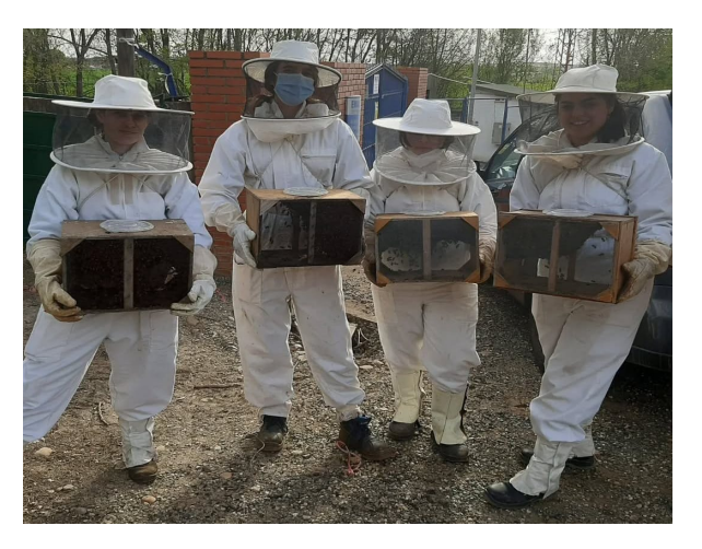
Figure 33: Women in rural areas and their role in MA.

Multifunctional agriculture empowers rural women by creating opportunities in agritourism, food production, and resource management. For instance, in Slovenia, women lead agritourism initiatives, which boost economic independence (Ref. 629), while Croatia's "Lika Destination" project increases women's involvement in decision-making (Ref. 630). Social services in Spain and Ireland provide business and governance training to enhance women's skills (Ref. 631) (Ref. 632). Gender-sensitive policies in Slovenia and Croatia, such as equal land access and targeted grants, support women's leadership in agriculture (Ref. 633). Programs such as Slovenia's "Women on Farms" (Ref. 634) and Spain's "Entrepreneurial Women in Rural Areas" (Ref. 635) promote women's economic status and active participation in rural development.