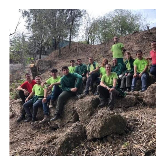
Figure 30: Landscape and degradation. Own preparation