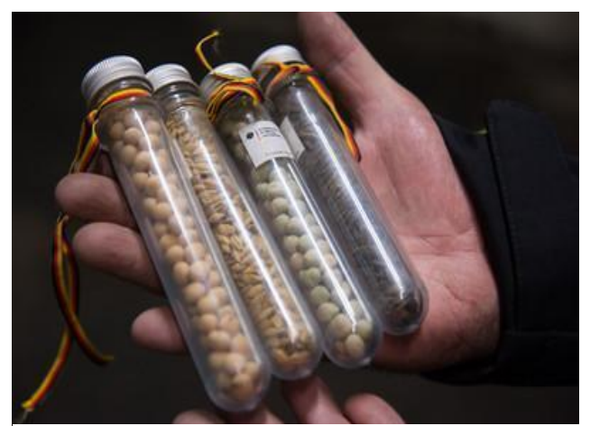
Figure 32: Seed conservation

Multifunctional agriculture supports food self-sufficiency by promoting locally adapted crops, such as buckwheat and spelt in Slovenia (Ref. 627), and the Istrian bean and Dalmatian olive in Croatia. Agricultural diversification, such as Spain's Dehesa system and Ireland's "Origin Green" initiative, reduces import dependency and supports local food production. Agro-ecological practices, which include crop rotation and organic farming, enhance soil health and long-term food security. Seed banks and native breed conservation, exemplified by Spain's "Red de Semillas" and Ireland's livestock preservation efforts, ensure resilience to climate change (Ref. 628). Integrating circular economy principles, as seen in Slovenia's "Zero Waste" and Spain's "Mercados de la Tierra" initiatives, boosts resource efficiency, reduces waste, and enhances local food systems.