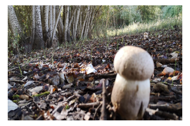
Figure 17: Natural space with potential for Mycological exploitation (MA Fiñana).

As this is a module aimed at agricultural teachers, as well as other interested trainers with or without experience in the agricultural world, it is essential to address the management and compatibility of activities in multifunctional agriculture. To this end, a development of chapters is proposed in which different aspects are analysed. First, the activities that are carried out in the company and those that can potentially be implemented are studied. Secondly, the available resources are analysed to proceed with their management and, finally, the planning of activities is proposed to carry them out successfully, with the aim of achieving the effectiveness and efficiency of all activities and their optimisation.