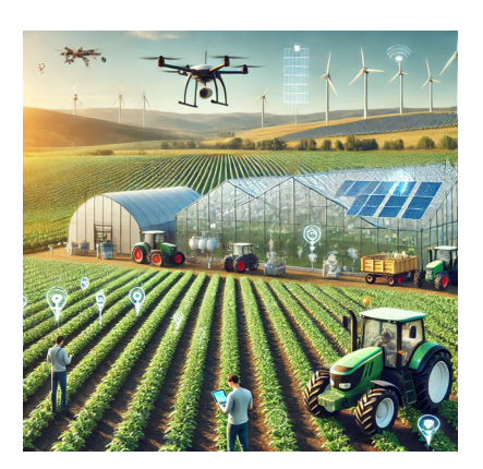
Figure 16: Render of future implementation of renewable energy systems (Al generated).

However, the photovoltaic sector will also face some challenges during this new year: