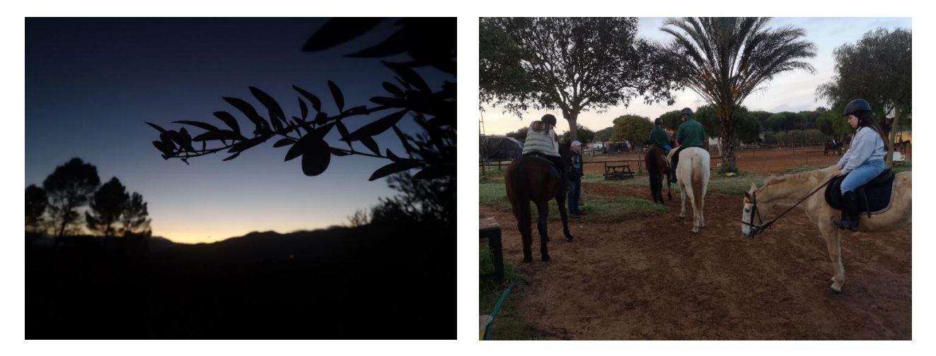
Figure 26: Activities and resources in Multifunctional Agriculture (MA Fiñana).

According to some authors, resource management techniques can be divided into four areas: