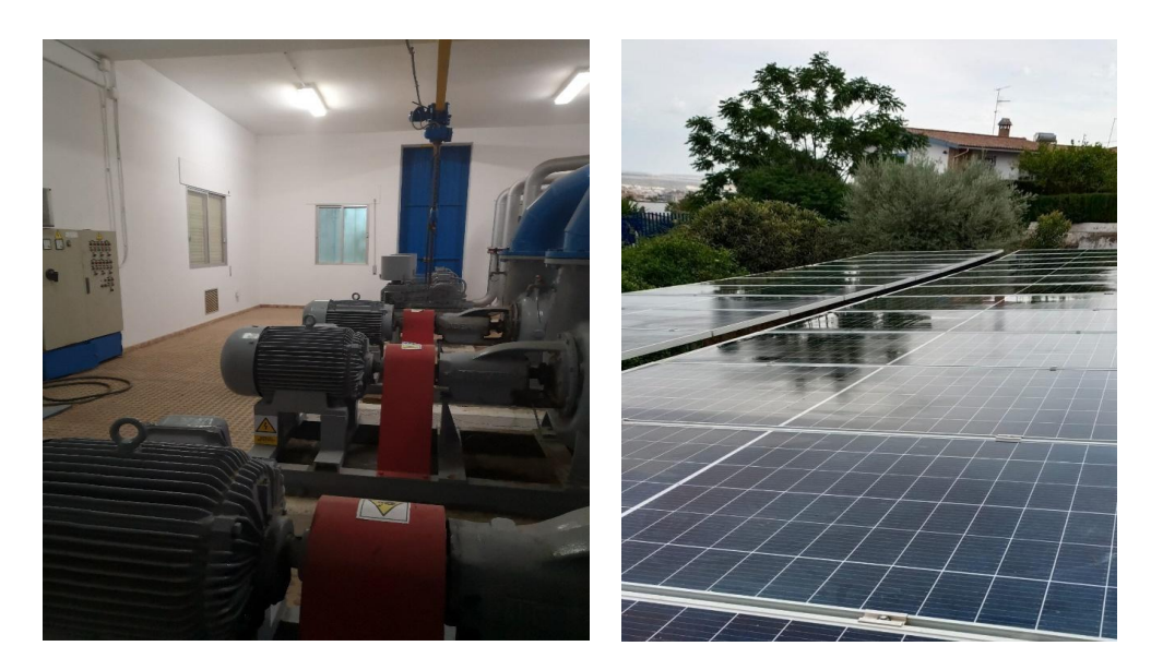
Figure 27: Examples of material (physical) resources of the MA company (P.Ledesma).