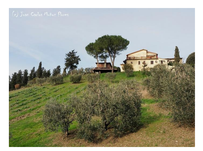
Figure 1: Fattoria Poggio Alloro in San Gimignano, Tuscany (Italy).

In this type of tourism, the key element is the farming activity and the rural way of life itself. Thus, tourists want to immerse themselves in the rural world, get to know it first-hand and even participate in some of the farm's tasks, such as milking a cow or a goat, feeding the cattle, picking fruit or vegetables from the orchard, harvesting, baking bread or cakes, cooking traditional recipes, etc. They can visit the surroundings and even participate in other activities (cultural visits, trekking, horseback riding, adventure sports, bird watching, etc.), but these are a complement, not the main purpose of the holiday.