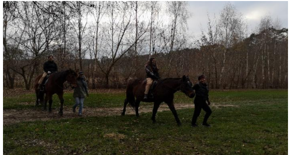
Figure 21: Rural tourism with equestrian rides (V. Paputsevich).

For the successful development of the company, its objectives must first be defined. Then, the activities that can be developed will become visible, both the eminently agricultural ones (agriculture, livestock and forestry) and the potentially multifunctional ones, such as rural tourism (wine tourism, food tourism, mycotourism...) or renewable energies, to mention a few.