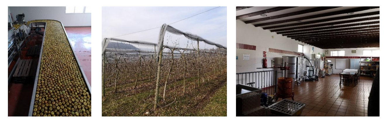
Figure 24: Examples of material resources of the company (A. Seco de Herrera).

Material resources are movable and immovable property. Movable property includes raw materials, machinery and tools, as well as other resources necessary in the production process.