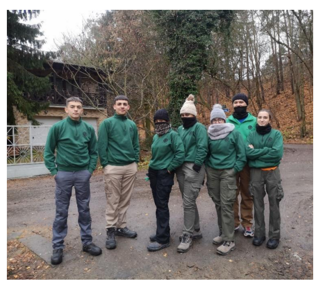
Figure 23: Know-how abilities (MA Fiñana).

Material resources are movable and immovable property. Movable property includes raw materials, machinery and tools, as well as other resources necessary in the production process.