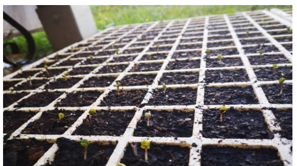
Figure 20: Plant production activity (A. Seco de Herrera).