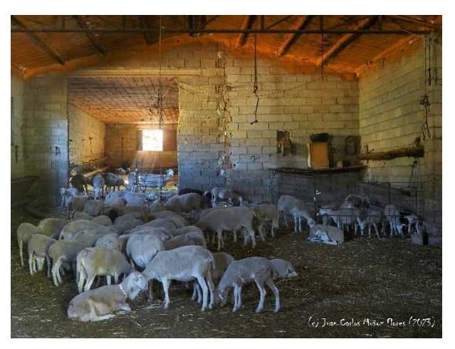
Figure 4: La Pariera, espacio rural (Spain), one of the selected best practices in STAY Erasmus+ project.

The STAY (Still Tourism Around Yard) project (2022-1-SI01-KA220-VET-000087663) identified 18 case studies on agrotourism across Europe, including best practices from Slovenia, Spain, Italy, Portugal, Czech Republic, Croatia and Sweden (Ref. 110).