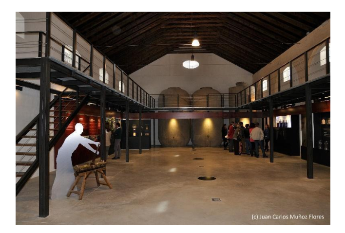
Figure 3:Visitors in a wine museum located in an ancient cellar.

The links between agrotourism and other niche products (such as food tourism, wine tourism or olive oil tourism) can be strong and sometimes, the boundaries between these tourism models can be blurred. Ultimately, it is more about which element we identify as the key one to define the model from a theoretical point of view.